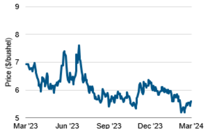
Wheat front-month contracts