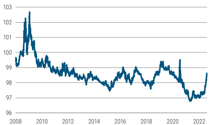
PIMCO U.S. Financial Conditions Index

Source: PIMCO, Federal Reserve, and Bloomberg as of 15 March 2022. The PIMCO US Financial Conditions Index (FCI) is a proprietary index that summarizes the information about the future state of the economy contained in a wide range of financial variables, including the fed funds rate, bond yields, credit spreads, equity prices, oil prices, and the broad trade-weighted U.S. dollar. The weights of these variables are determined by simulations with the Federal Reserve's FRB/US model. An increase (decline) in the FCI implies a tightening (easing) of financial conditions.